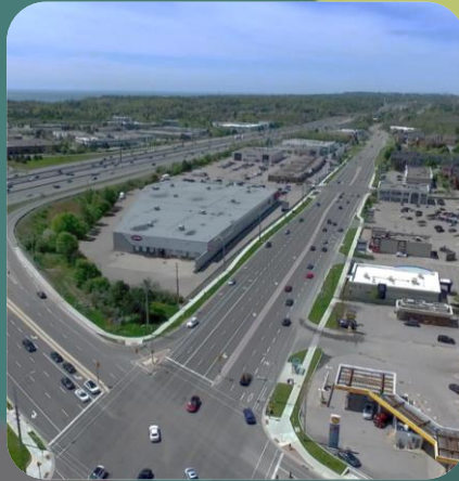
Kingston Road Re-Development