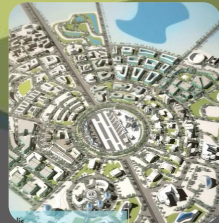
Toronto East Aerotropolis Project