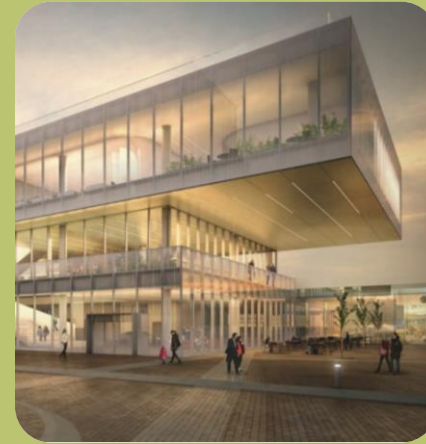
City Centre Vision