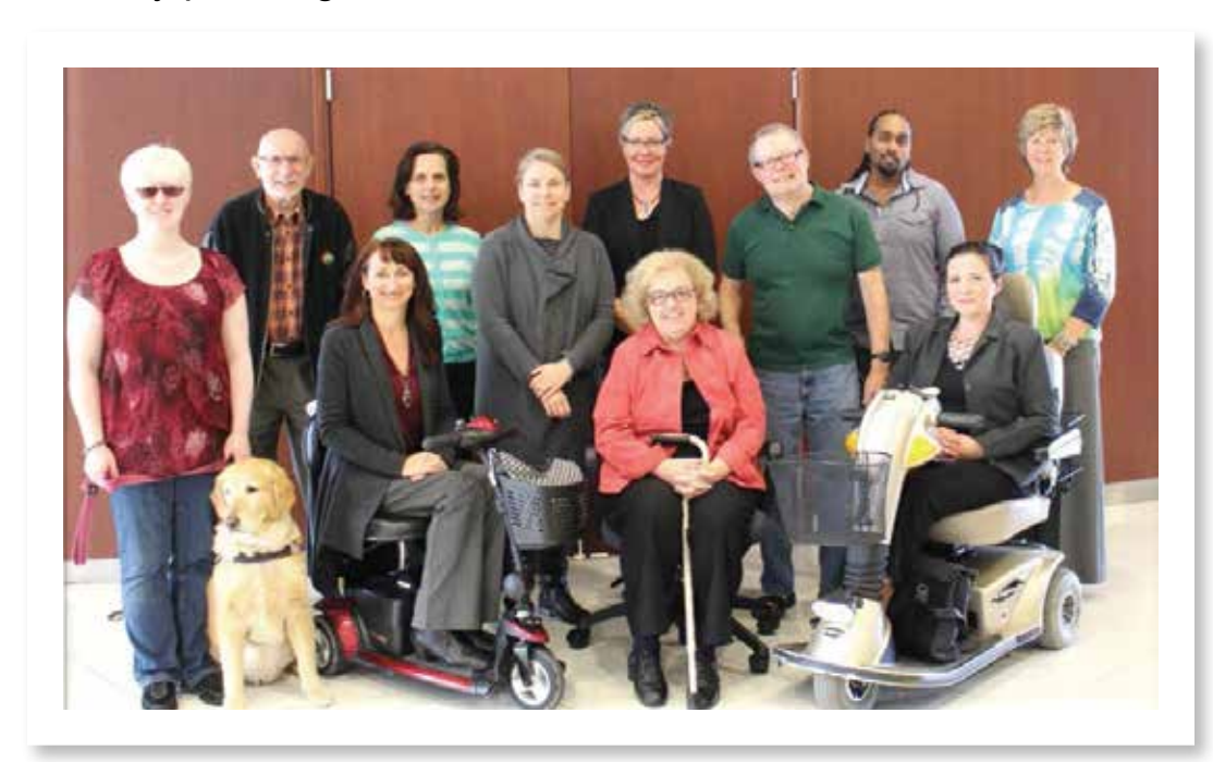
The Region of Durham's Accessibility Advisory Committee (AAC).

The enactment of ODA also required that the Region of Durham form an Accessibility Advisory Committee (AAC) to advise on accessibility throughout by-laws, policies, programs, practices and services. The AAC remains in formation today with 11 members, including a Regional Councillor. This committee is an important and valuable piece to the Region's accessibility planning.