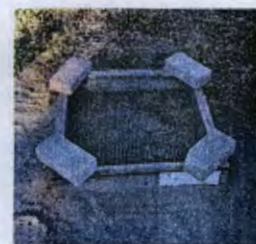
Turtle Nest Protection Structure