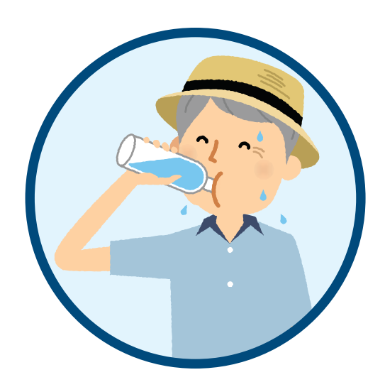
Drink water regularly. Don't wait to feel thirsty.