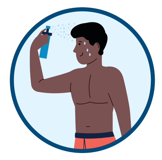
Fill a spray bottle with water and mist skin frequently to help prevent overheating.