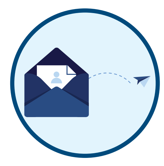
Be prepared! Sign-up for email notification of extreme heat events at durham.ca/heat