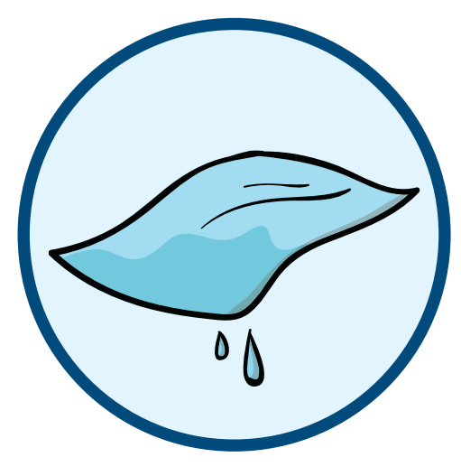
Place wet towels in the fridge and layer on body to help prevent overheating.