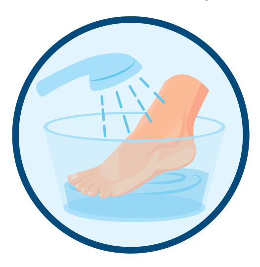
Take cool showers or place feet in cool water to help prevent overheating.