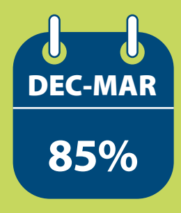
of cases occurred in Dec-Mar