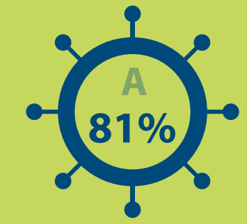
of cases were influenza type A, and 19% were influenza type B