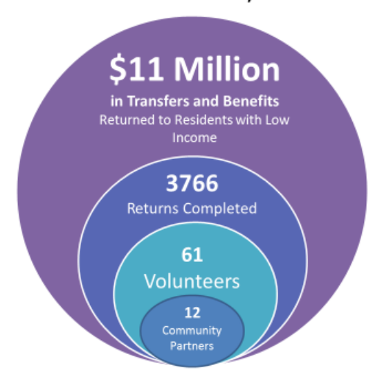
Tax Season 2019 - Community Clinic Results

Data shared from our community partners indicates that approximately $11 Million was returned to low income residents via tax filing