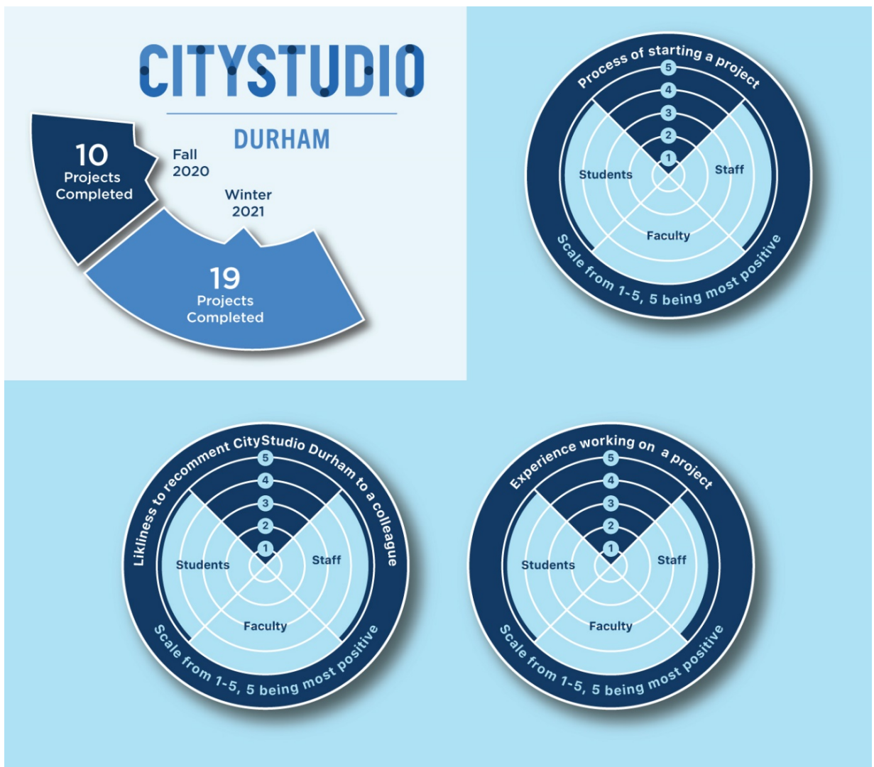
Figure 1: CityStudio Durham Project Numbers and Feedback Metrics