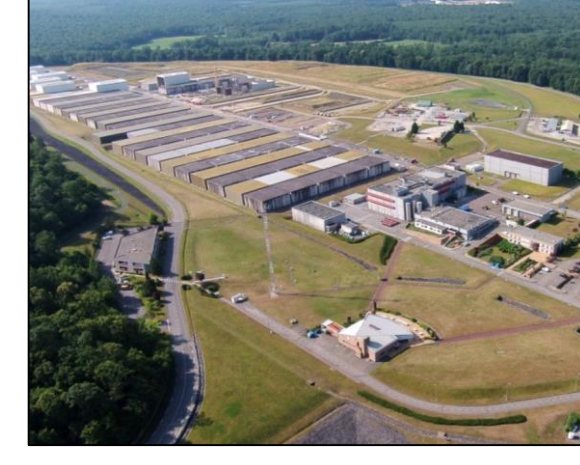
Near-surface: Centre de l'aube, France