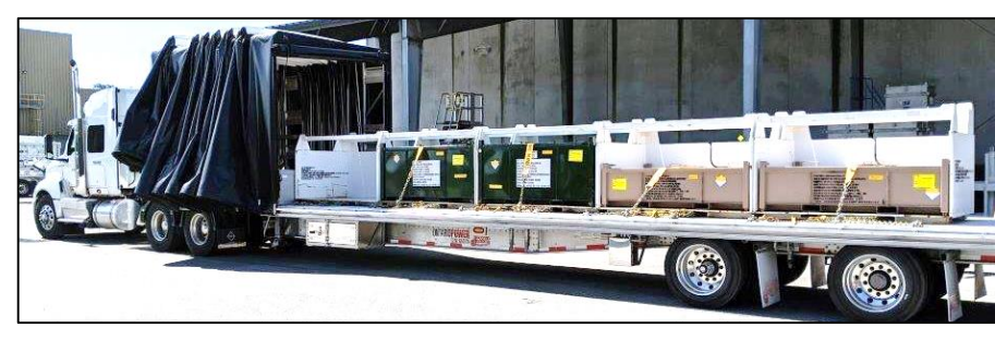
Special DSTAR packages were built for Refurbishment project.