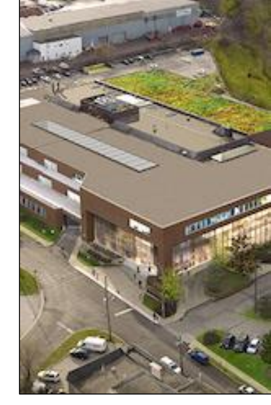
Research laboratory at McMaster Innovation Park – a partnership between OPG subsidiary Laurentis Energy Partners, and McMaster University – opened in 2020