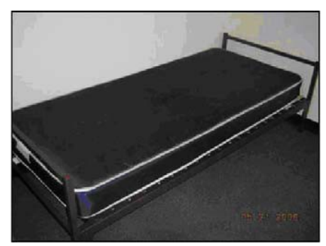
A metal bed frame and vinyl mattress will minimize bed bug problems if moved away from the wall.