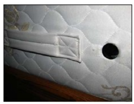
Bed bugs may be found along piping seams, under pillow tops, between the mattress and box spring, inside air holes, or underneath mattress handles. Do not overlook tears in the fabric or stitching holes when inspecting for bed bugs.