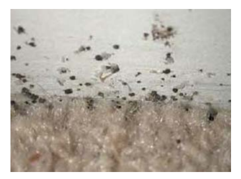
Bed bug eggs and faecal stains along the edge of the carpet.