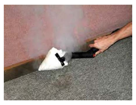
Steam treatment of the baseboard. Note that the wand is covered with a terry wash cloth to increase and retain heat.

It is recommended that a professional type steam machine with a large water-holding capacity (at least 4 L), many types of attachments, and variable output rates be used. Dry-steam or low vapour steamers are a better choice because they use and leave behind less moisture. When steam is used is should be immediately followed up with or in conjunction with vacuuming. Steam will flush bed bugs out of their hiding spots to be killed or vacuumed. Use a wide nozzle instead of a single-holed nozzle as it may concentrate the steam into a jet that can dislodge bed bugs allowing them to escape the effects of the heat. Move the steam cleaner nozzle slowly to maximize depth. A person using a professional steam cleaner should monitor the heat output of the steam, using a thermal monitor, to ensure surface temperatures are at least 80oC after the steaming nozzle has passed that surface. Depending on the baseboard thickness and crevices available it may be more effective to use a nozzle tip to place steam behind the baseboard.