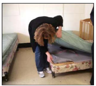
Check between the mattress and box spring and along every fold of material for signs of bed bugs