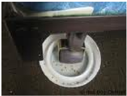
Bed bug interceptor. Bed leg is placed in the inner section. Talcum powder is incorporated in the interceptor to prevent bed bugs from climbing out.