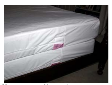
Use mattress and box spring encasements.