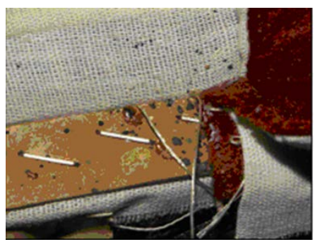
Bed bugs and faecal spots on the underside of an upholstered chair.