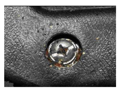
Bed bugs hiding in the screw hole of an office chair.