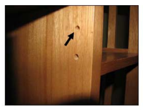
Tiny spaces in the bed frame and other furniture, such as a peg hole for a shelf, are ideal hiding spots for bed bugs.