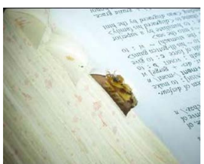
Bed bugs hiding in the tab of a dictionary.