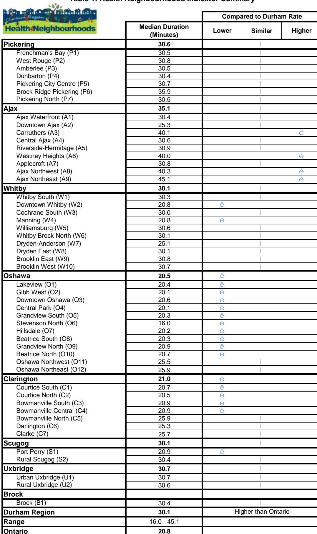
Table 1: Health Neighbourhoods Indicator Summary