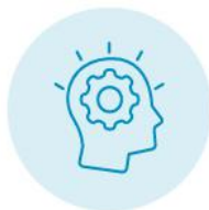
Rester attentif à l'environnement