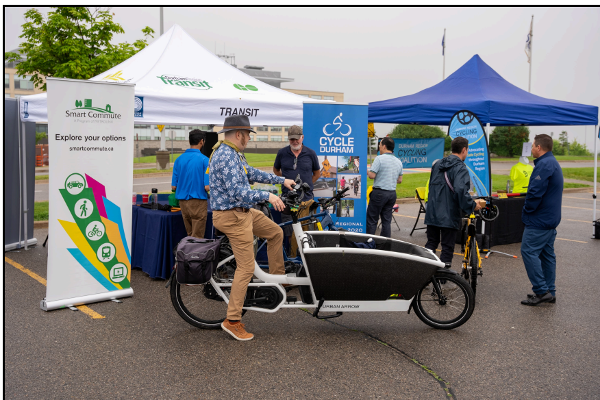
Photo Description: Bike to Work Day was held at the Regional Headquarters building on June 6, 2024 for the first time since the Pandemic

In Partnership with the four foundations of Lakeridge Health (Ajax Pickering, Oshawa, Bowmanville and Port Perry), the Region supported Bike for Health. This charity bike ride was held on June 2, 2024 and started/ended at Ajax Downs.