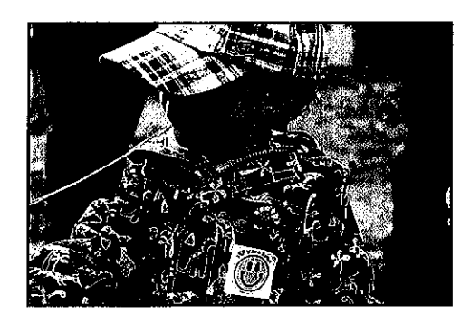
Enjoying some maple taffy!