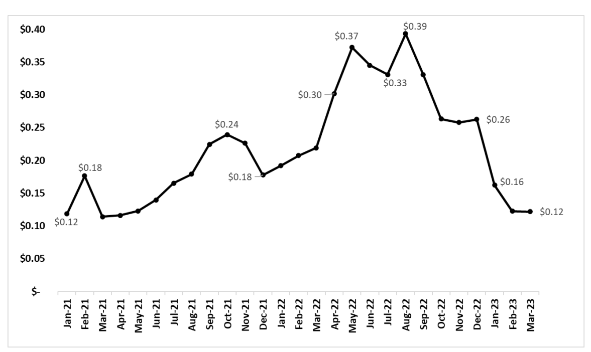
Figure 2: Natural Gas Prices (Union Dawn Ontario Price Canadian $/cubic meter)