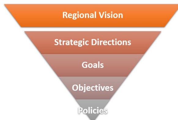
Figure 2 – Illustrating a new ROP framework

6.1 In addition to broad strategic directions, ambitious goals, pragmatic objectives, and action-based policies, the new ROP will be founded on a strong vision for the region's future. The proposed framework for the new ROP is illustrated in Figure 2 below.