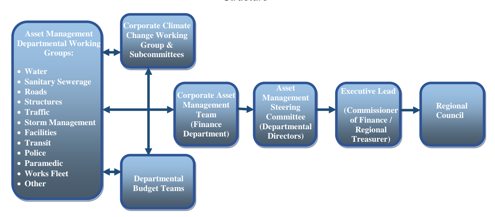
Figure 2: Durham's Asset Management Organizational/Governance Structure

The analysis and condition assessments undertaken by various Asset Management Departmental Staff Working Groups (for each specific service area), will be coordinated by the Corporate Asset Management Team (Finance Department), based on workplans endorsed by the Asset Management Steering Committee (Departmental Directors). The Region's Corporate Climate Change Staff Working Group and its subcommittees (Energy Advisory and Adaptation subcommittees), as well as Risk Management staff and the various Departmental Budget staff, will support the asset management planning process for a fully integrated and coordinated approach.