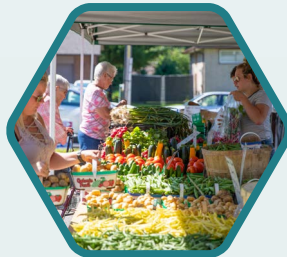
Household Food Insecurity