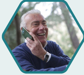
Self-Rated Mental Health