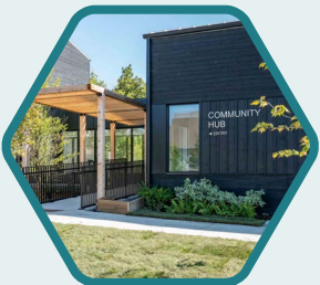
People Experiencing Chronic Homelessness