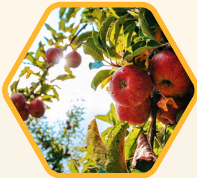
Gross Farm Receipts