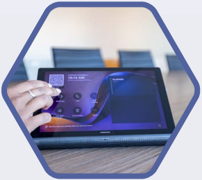
Access to Broadband