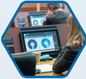
Strategic Plan Performance