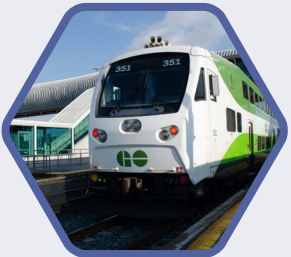
Transportation Mode Share