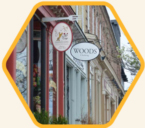
New Business Starts