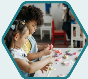
Children's Early Development