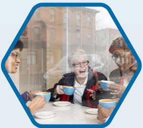
Sense of Belonging to the Local Community