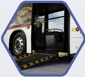
Access to Public Transit