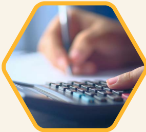
Real Median Household Income