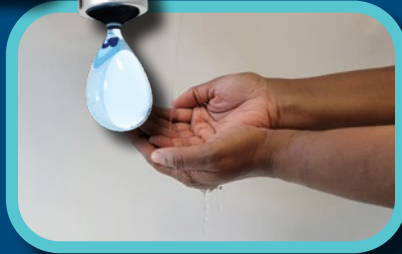
Step 1: Wet hands