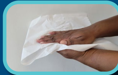
Step 5: Dry hands