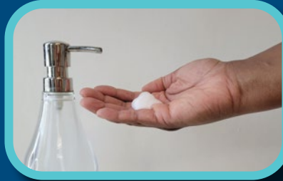
Step 2: Apply liquid soap