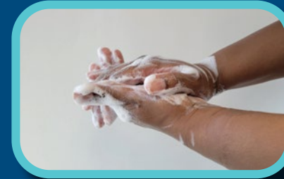
Step 3: Scrub backs of hands, between fingers, thumbs and around fingernails for at least 20 seconds