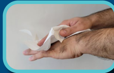
Step 5: Dry hands