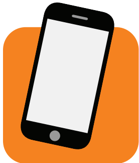
Phone & internet