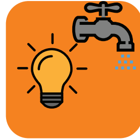
Hydro and water